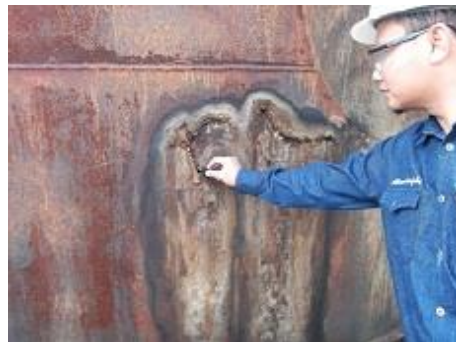
Corroded Condition of Tank