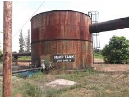
Sump Tank at Oil & Gas Plant