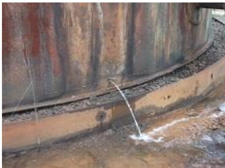
Leak at Tank Bottom