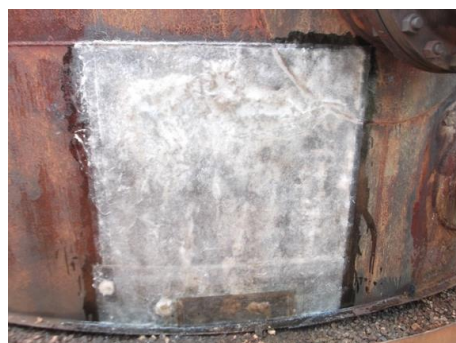
Repair works with SealXpert™ Surface Tissue