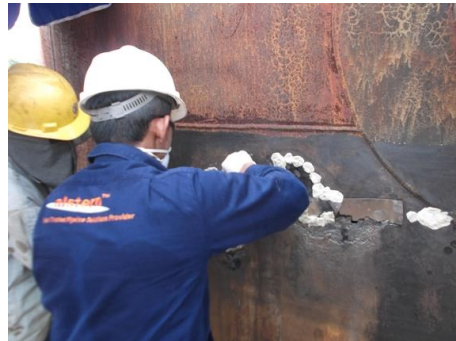
Repair works with Seal Stic™